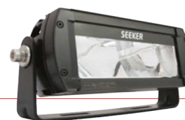
Three adjustable mounting options included with each SEEKER lamp